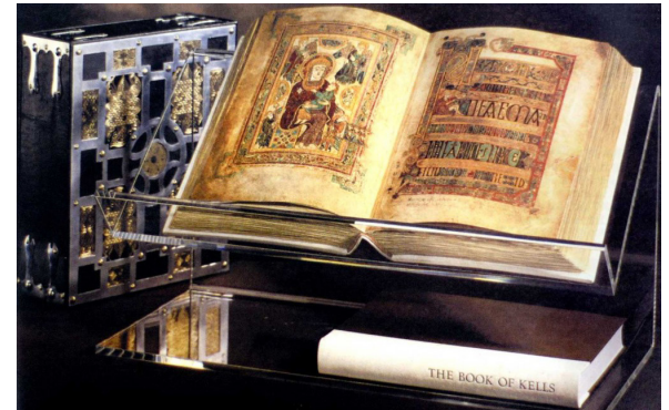
below: Book of Kells, Trinity Library; Dublin, Ireland