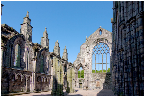
Holyrood Abbey; Edinburgh, Scotland

www.statravel.com/travel-insurance.htm 1-800-781-4040